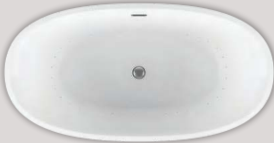
LIBRA AURORA 6634 (FREESTANDING)